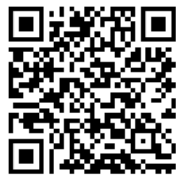
Full Written Tutorial